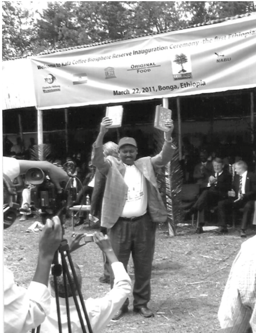
Fig. 22: Inauguration of Biosphere Reserves, Keffa, Ethiopia, March 22, 2011 (handing over of works of F.J. Bieber)

Cape Mount Province. There, near Sierra Leone, lies Fisherman's Lake, which is fed by several creeks. With our boat we could use these creeks as roads. We spent about six months in the forest there and caught two pigmy hippos. Unfortunately the transportation to Monrovia was very difficult, and we lost them both (Fig. 19).