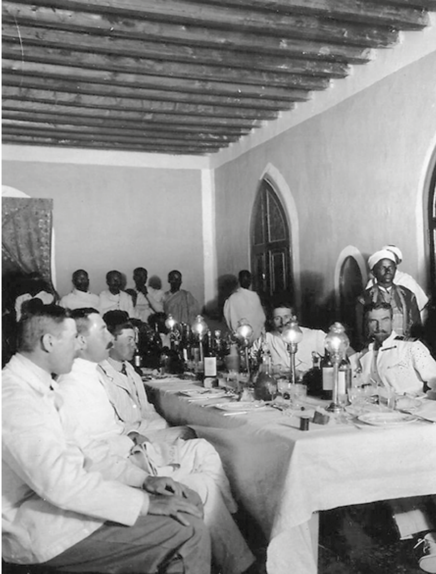
Fig. 6: The Austrian Trade Mission at dinner in Addis Ababa, 1905