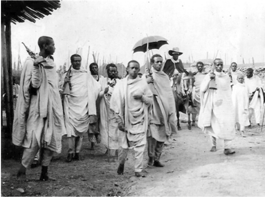
Fig. 4: Emperor Minilik II. and Retinue, 1904