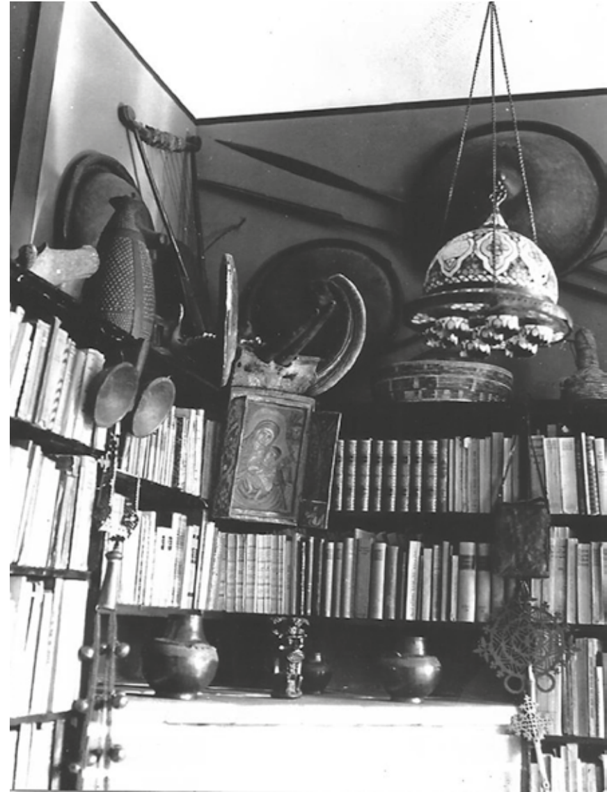
Fig. 18: The Africa Room in the apartment of Otto Bieber, Vienna