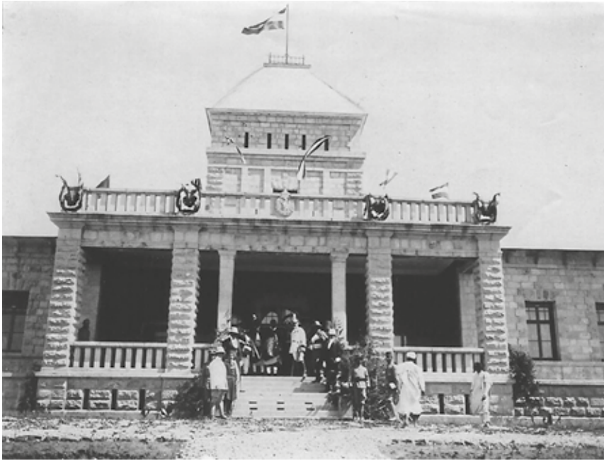
Fig. 8: The German Embassy in Addis Ababa, 1905