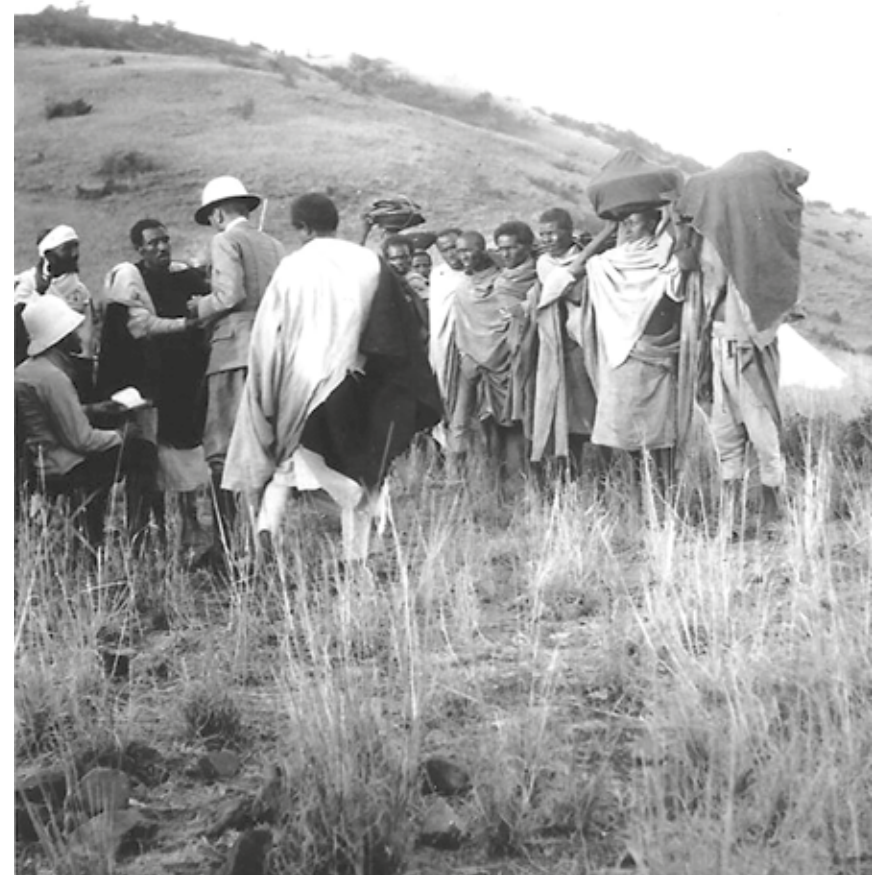
Fig. 7: Dergo in Ipfallanko, 1905 (at extreme left sits F.J. Bieber)