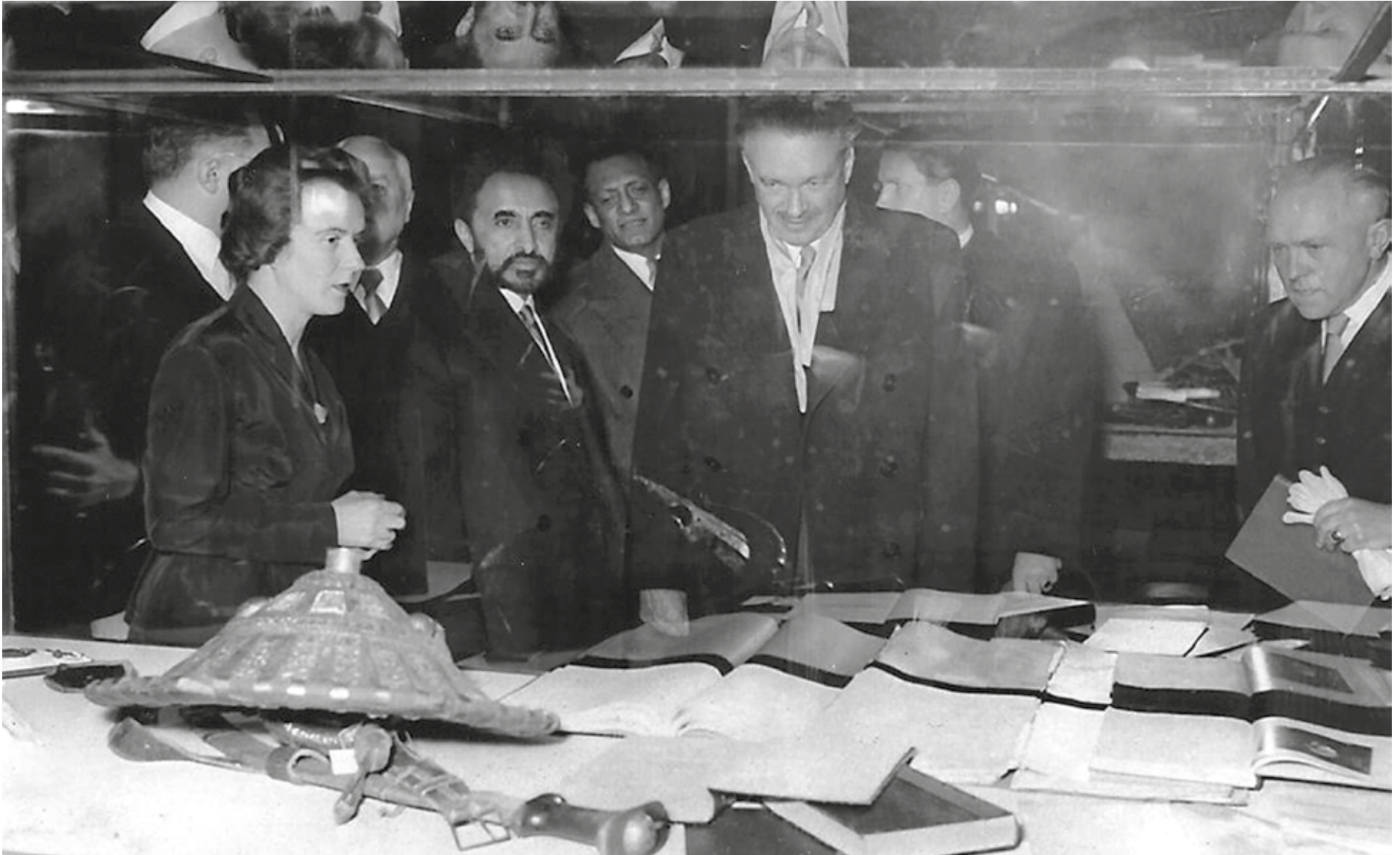
Fig. 16: Emperor Haylé Sellasé I visiting the Keffa Exhibition, Museum of Ethnology, Vienna, November 1954 (on the right: Otto Bieber)