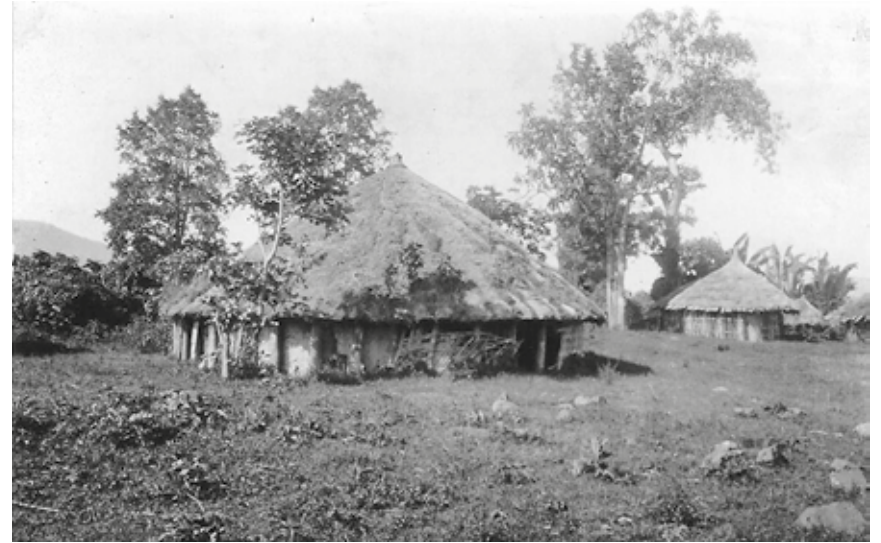
Fig. 11: Sanctuary of Heqo in Andracha, 1905