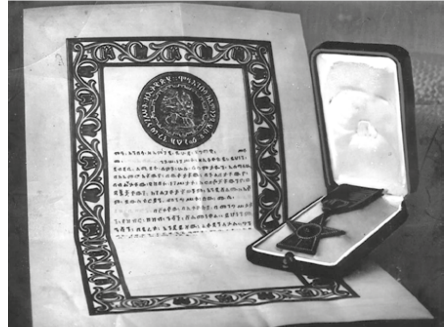
Fig. 5: The Star of Ethiopia (3 rd class)

The Austrians brought to Ethiopia thirty-six wooden crates of gifts and samples, which they began to distribute. Emperor Minilik II in-