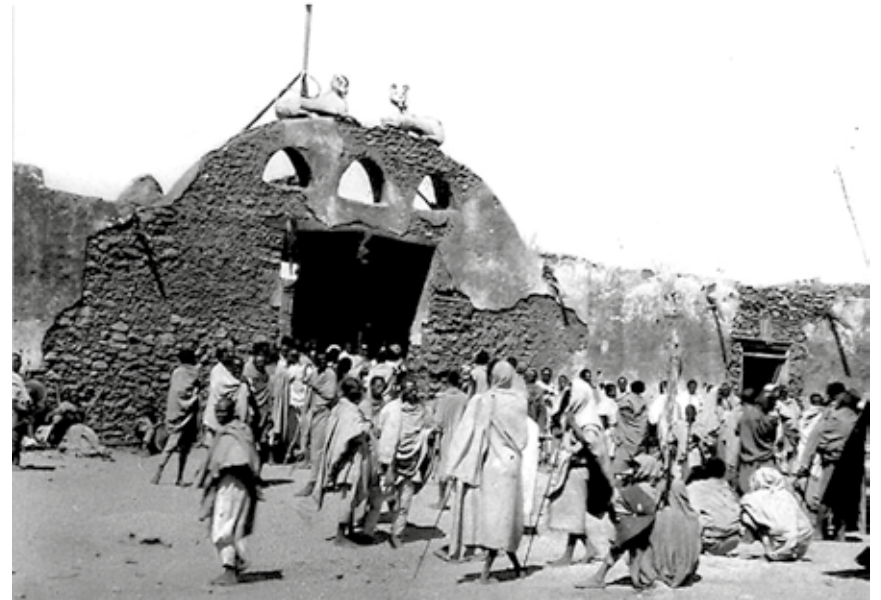
Fig. 3: The Lion's Gate at Harer, 1904