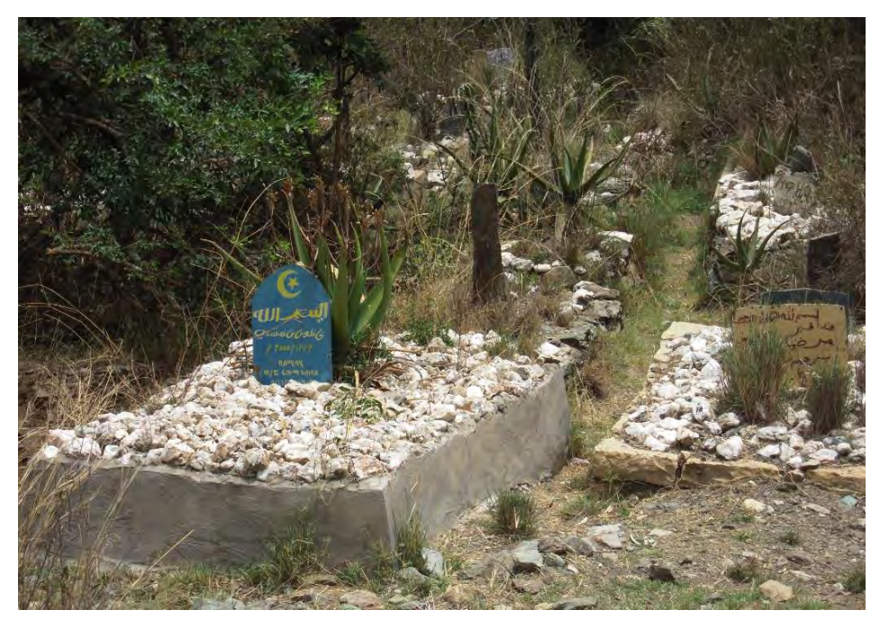
Fig. 2: The Muslim graveyard of Negaš beside the shrines, with modern Arabic and Tigrinnya inscriptions, 8 May 2011