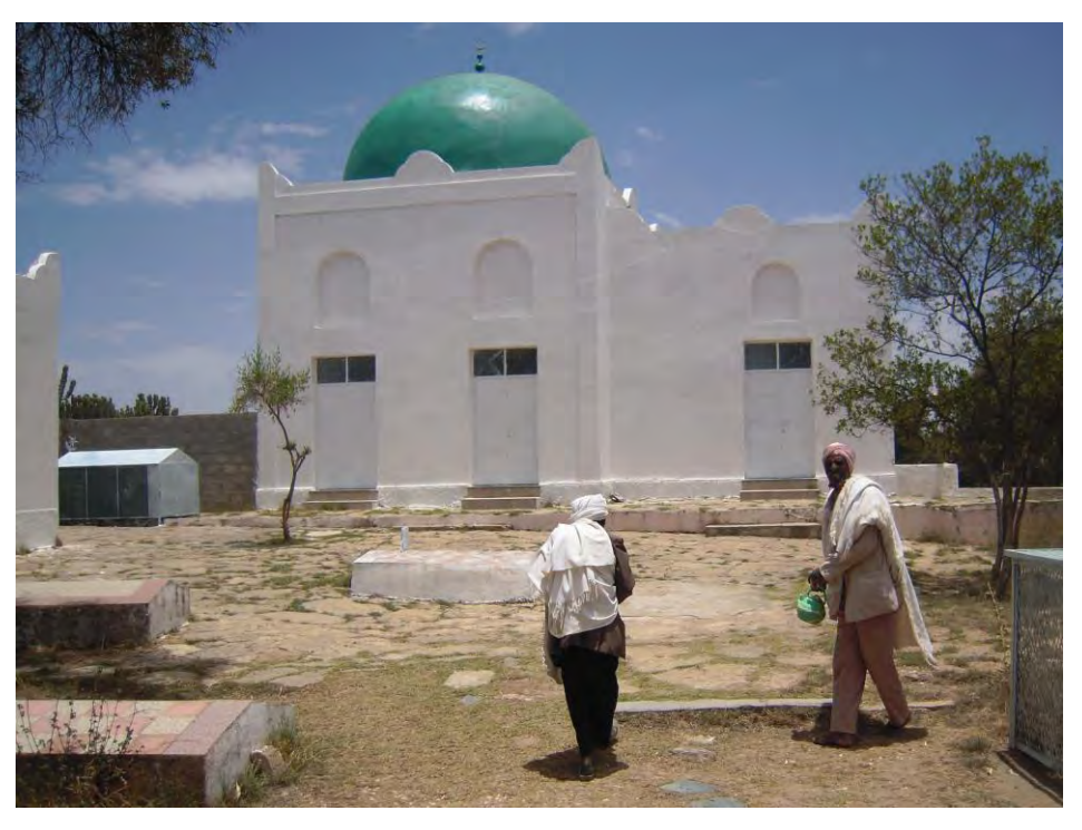
Fig. 3: The shrine of the twelve companions of the prophet in the middle, in which the inscription is kept, beside a smaller shrine on the left, 8 May 2011