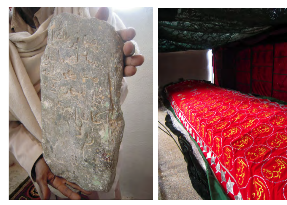
Fig. 4: Another view of the same inscription, and fig. 5: The renovated tomb of the 12 companions of the prophet Muḥammad, covered by a tapestry embroidered with the 99 names of God, 8 May 2011 (photos: W.S.)

To conclude: The incription described here provides early epigraphic and material evidence for the historical Muslim presence in Negaš, and is a witness to a local memorial tradition referring to the Aksumite ruler, an-naǧāšī al-Aṣḥama. It is a further example for the Tigrayan Muslim tradition following the Arabic tradition, by using the king's the name as he is remembered in Arabic. In addition, this seems to be the first example of a stone inscription in Ethiopia bearing the country's name in Arabic, which is otherwise well attested in numerous other sources starting from medieval times.